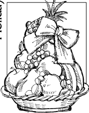
Holiday Food Baskets